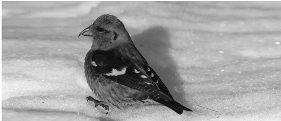
White-winged Crossbill by Leonard Medlock, 1/26/09.

In Berlin, follow Main Street (Route 16) to the 12th Street Bridge, turn right and cross bridge, and then turn left heading north. Stop at the Berlin Industrial Park to check for Snow Buntings and Horned Larks. The White Mountain Chalet is just north of the park. Gray Jays were daily visitors here during the winters of 2007 and 2008. Proceed north to Success Loop Road on the right. There are many feeders visible from the road. Gray Jays have also been reported here. A Northern Goshawk was seen on a 2008 winter finch trip. Return to East Milan Road and make a right to go to the airport. Restrooms are in the terminal building and always open.